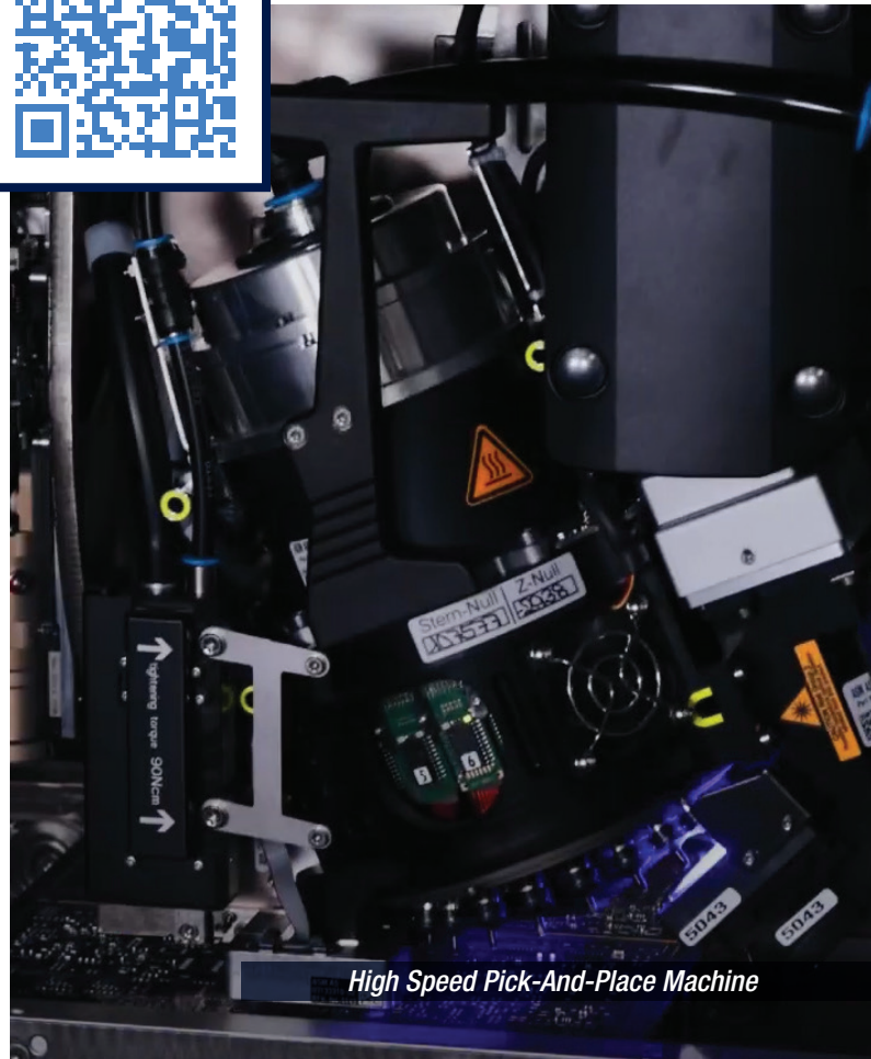
High Speed Pick-And-Place Machine