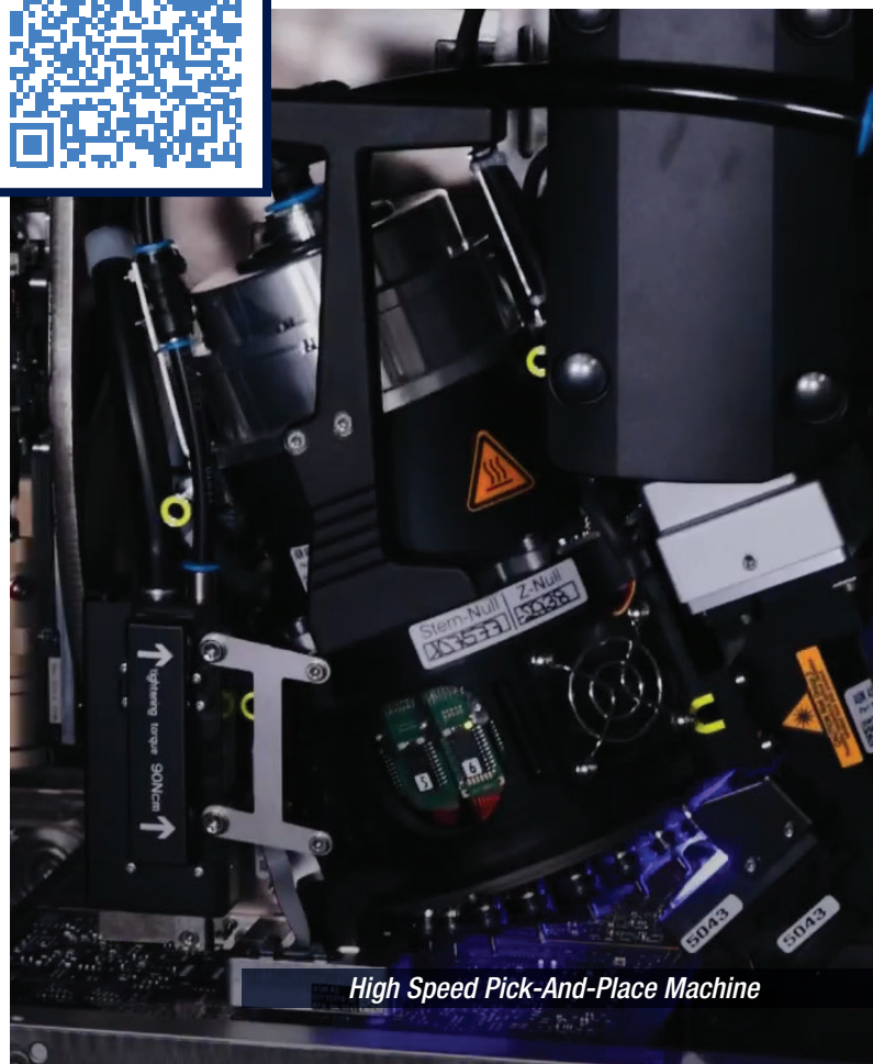
High Speed Pick-And-Place Machine