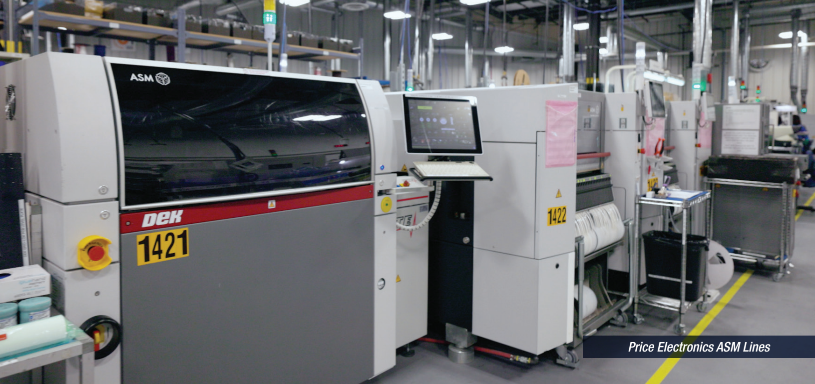
Price Electronics ASM Lines